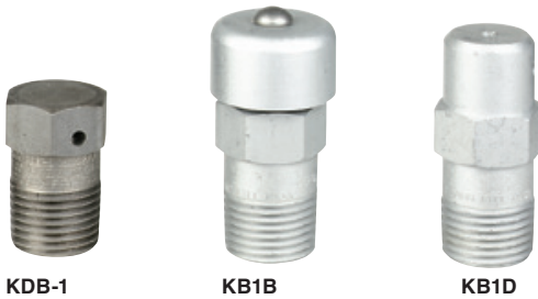
KDB-1 KB1B KB1D